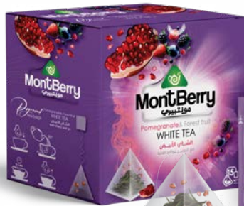
Pomegranate & Forest fruit WHITE TEA