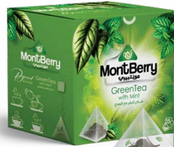
GreenTea with Mint