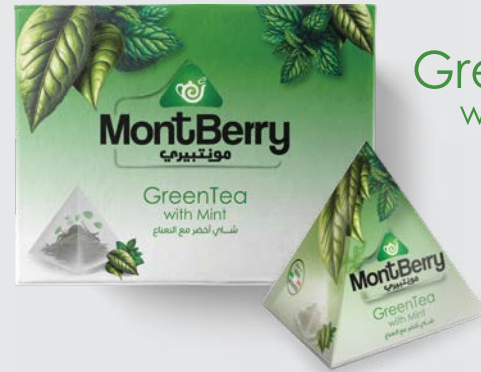
Green Tea with Mint