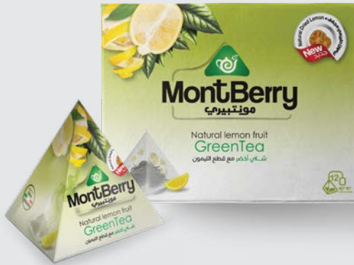
Natural lemon fruit Green Tea