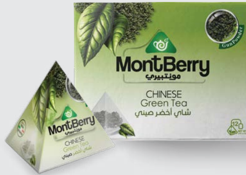
CHINESE Green Tea