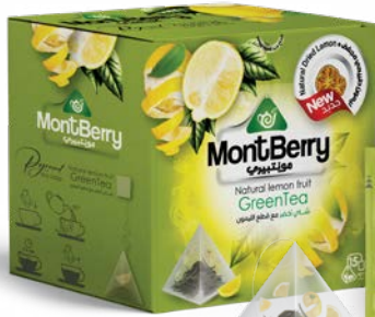
Natural lemon fruit GreenTea