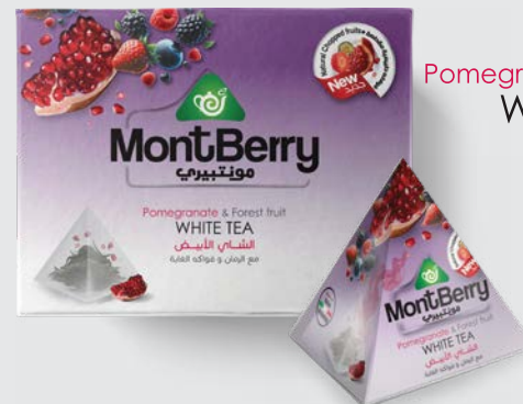
Pomegranate & Forest fruit WHITE TEA